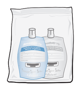
Place both breath sample bags in the provided transport bag

For detailed information regarding the step-by-step procedure, refer to the BreathID® IDkit Hp™ Two Package Insert