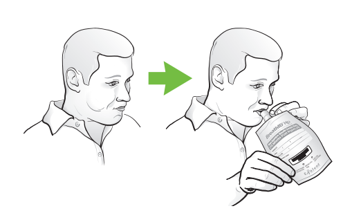
7. Instruct patient to hold their breath for 4-5 seconds, and then exhale into the gray POST INGESTION breath sample bag