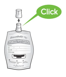
8 Push the cap until it clicks