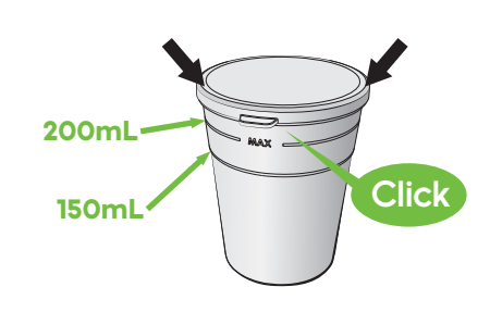
Prepare test drink in 150 to 200 mL of tap water, then close the cup firmly using both hands